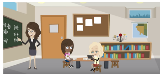
Tiffany thinks that all Black kids are dumb. The other day when the teacher wasn't looking, she called Casey stupid.

Following the discussion, parents and children were independently asked to complete a set of post-measures, including another IAT, in separate rooms.